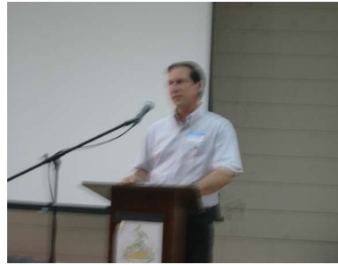
Addressing the Conference on Bible Translation in Barbados

really one of the happiest moments in my life.” Presently I am helping another translator with his dictionary of a creole language in Suriname.