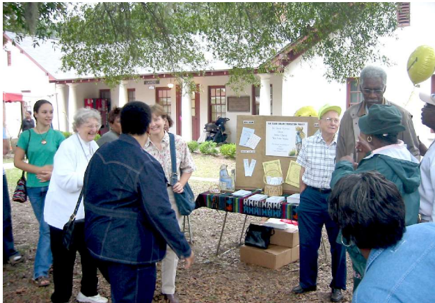
The launching of the Gullah Gospel of John last November

The past year has brought its share of milestones, travels and struggles. It seems that there is always too little time for all we want to do, and too few resources. But God is gracious and merciful, as we trust in His provision and count on Him to do what we cannot do in our own strength. We want to take you through the highlights of how God has led us through the past year.