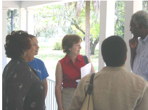
Gullah planning meeting in July

The end is in sight for this translation that was begun in 1979. While we continue to work on checking and refining the Gullah New Testament, we are starting to turn our attention to the printing and publication process, and a program to promote the use of the translation. The goal is to turn the manuscript over to the American Bible Society for printing by the end of this year, and to have it in print before the end of 2005.